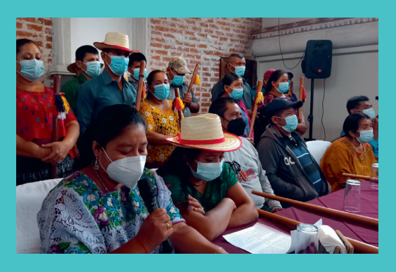
Press conference of the communities in peaceful resistance of El Estor, Guatemala

In 2022 , the European stainless steel producer Outokumpu, reportedly supplier of Bosch-Siemens, IKEA, and Voestalpine Böhler Edelstalul, suspended all purchasing from the El Estor nickel mine.