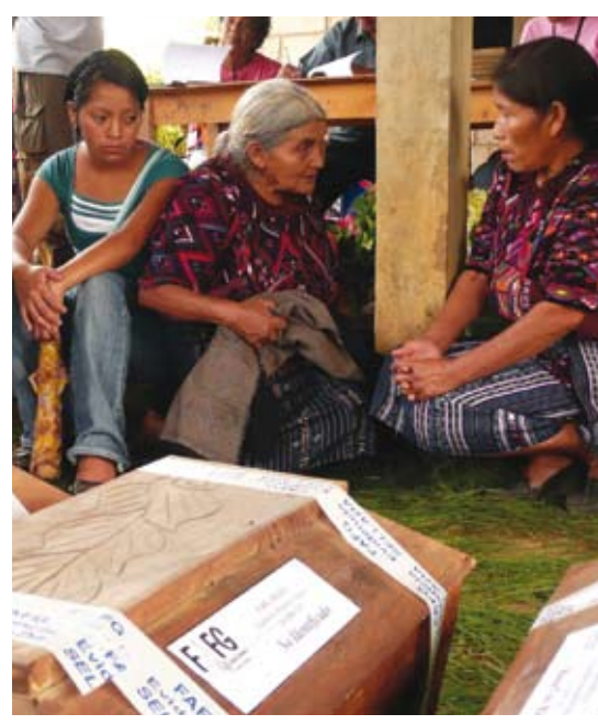
Burial of persons unknown, in the village of Lacema, Guatemala

By virtue of our being indigenous people, we are effectively ignored and abandoned. Our rights to education, housing, health - they have never been realised. So it has become necessary to organize ourselves again, to address everything that is happening. I am saying "again" because our people have been fighting these injustices since the eighties. When the peace agreements where signed, we all thought that everything would change, and for the better. It's sad to say that it didn't.