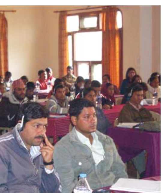
Nepalese Local Implementation Strategy is highlighted as a case of best practice

The work of Protection International is very much focused on ensuring that the implementation of European Union Guidelines on Human Rights Defenders (HRDs) is high on the agenda of Brussels-based institutions, such