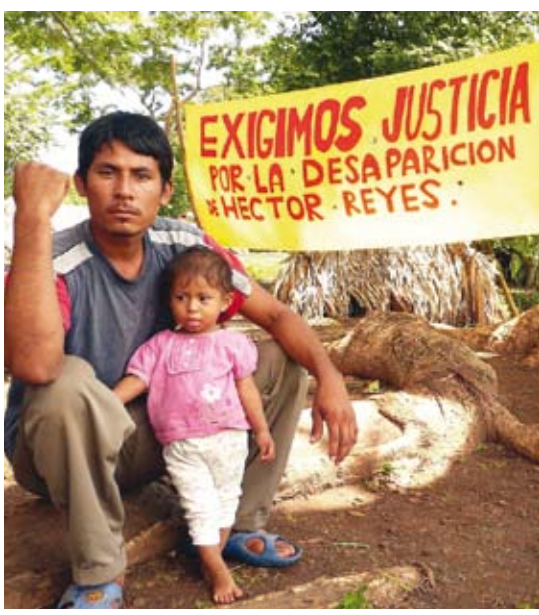
Middle: Memorial blanket dedicated to those murdered or disappeared during the genocide in Guatemala Above: Protest about land dispute-related violence, Nueva Linda, Guatemala

Conclusions were based on their own local experiences, along with international examples – such as those of Colombian defenders. Besides this, the participants established a connection between threats suffered by defenders associated with the megaprojects handled by the government and economic elites. They also devised strategies for remote, rural areas, and created an Immediate Alert Network, with the objective of helping defenders and communities who find themselves in great danger.