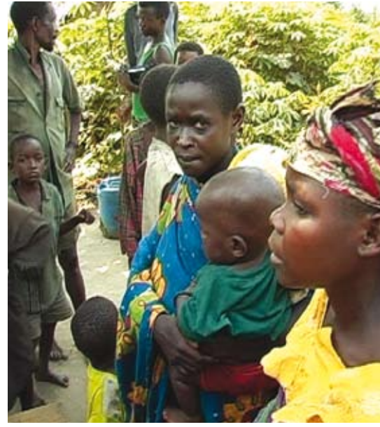
Displaced family in Bujumbura, Burundi

In 2008, those issues were shown to be as relevant as ever: by the end of March, in eastern Democratic Republic