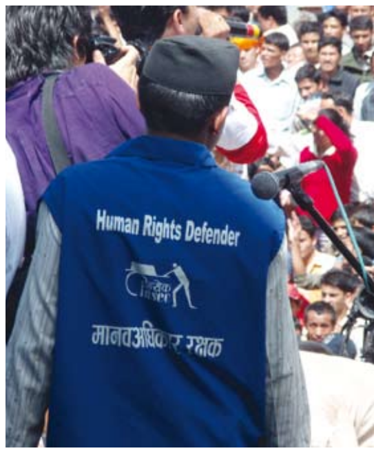
Observers from human rights organisation, INSEC, during a popular protest in Nepal

The Regional Consultations on Protection Mechanisms for Human Rights Defenders in Nepal will be published in English and Nepali. This project is, perhaps, a good example showing how NGOs and European Union Missions can work together to ensure defenders' protection. Of course, it was just the beginning of a long process: the real