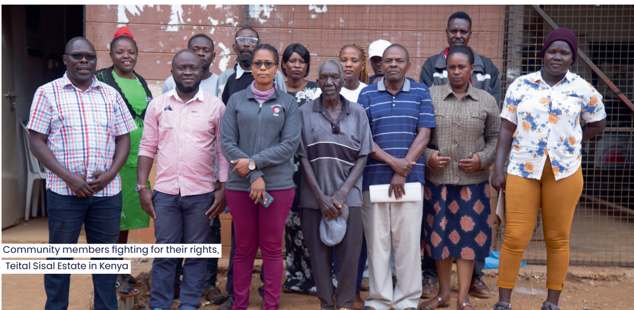
Community members fighting for their rights, Teita Sisal Estate in Kenya

“The management we had was very bad, such that if a community member goes to fetch firewood they would be arrested for trespass without even being warned. So it seems like their security guards are creating enmity between the community and the company.” Village leader from impacted community