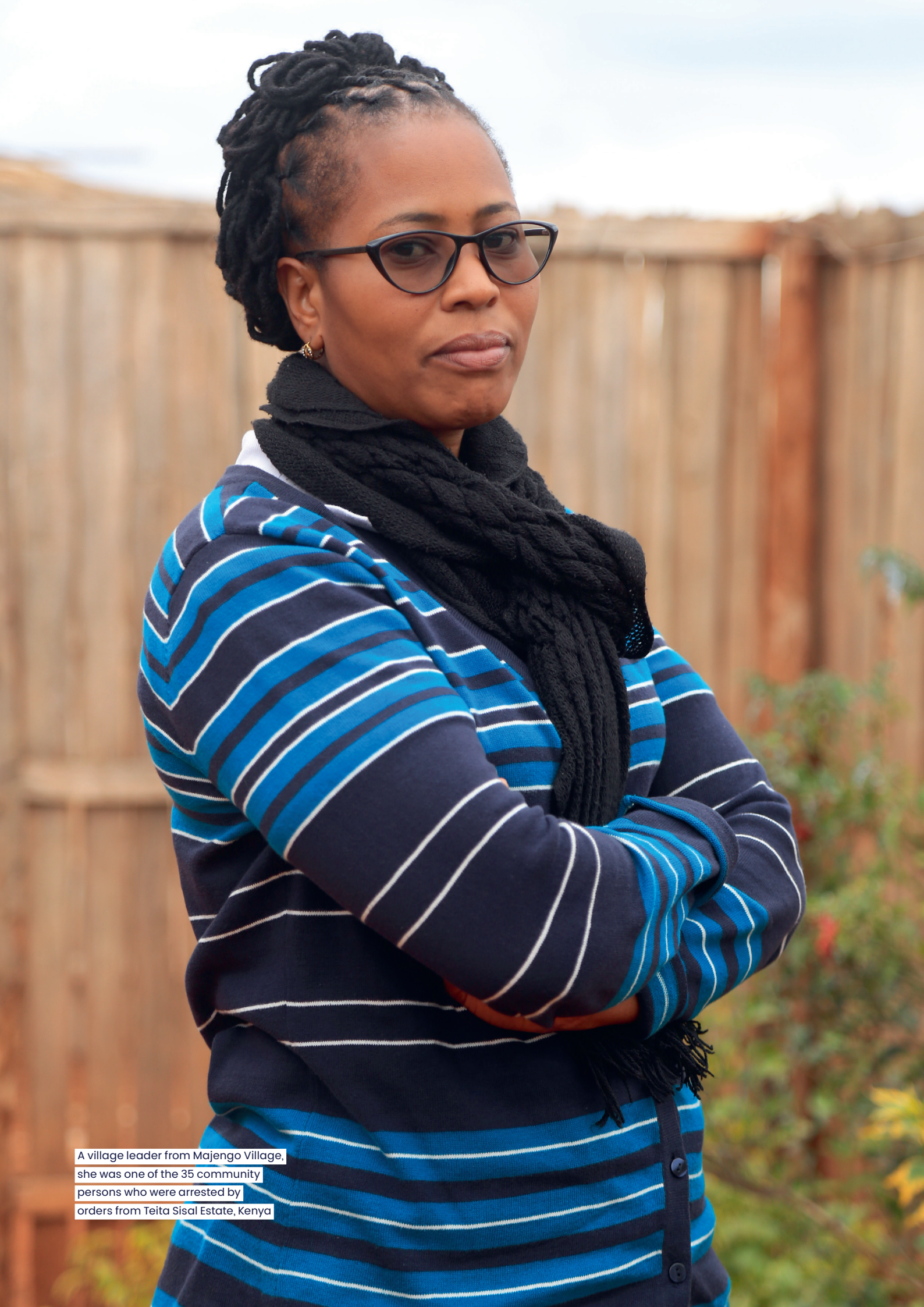
A village leader from Majengo Village, she was one of the 35 community persons who were arrested by orders from Teita Sisal Estate, Kenya