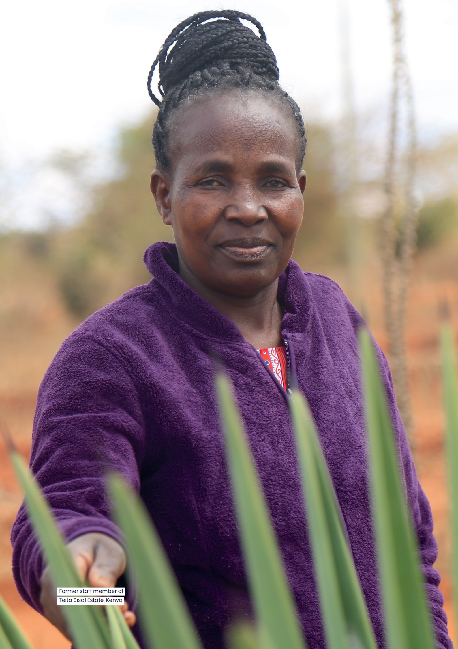
Former staff member of Teita Sisal Estate, Kenya